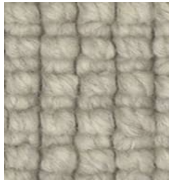
510 Ocean Sand