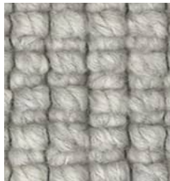
713 Summer Rain