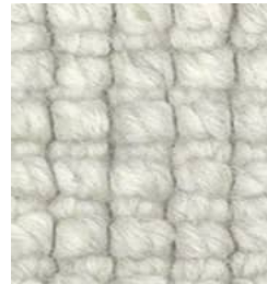
705 Tropical Oasis