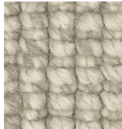
530 Mountain Ranges