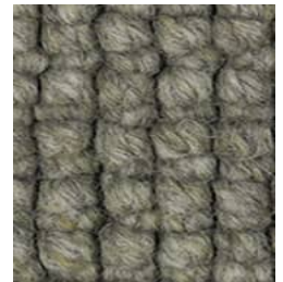
940 The Bungalow