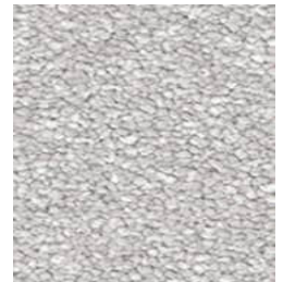
715 Wind Spray