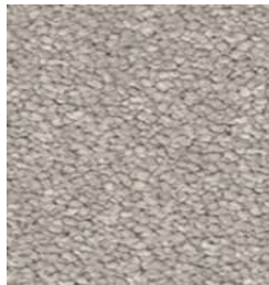
730 Cloudy Day