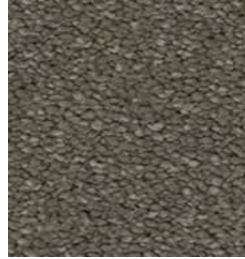
182 Cargo Stipple