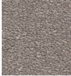
180 Brown Tweed