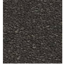
195 Shale Stipple