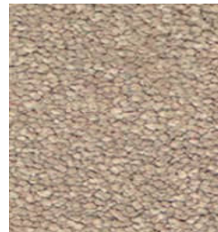
550 Warm Beige