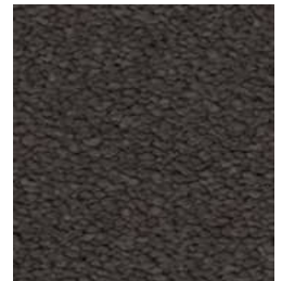
780 Dark Shadow