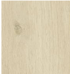
510 Sand Oak