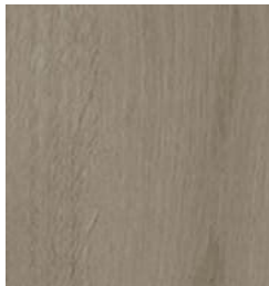
730 Sun Bleached Hardwood