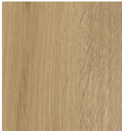
305 Natural Hardwood