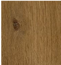
350 Golden Oak