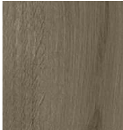
570 High Country Hardwood