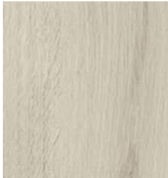
710 Coastal Hardwood