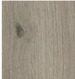
750 Hidden Valley