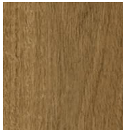
559 Southern Weathered Gum