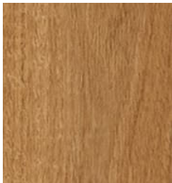
535 Northern Weathered Gum