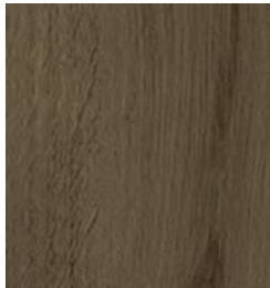
180 Mountain Hardwood