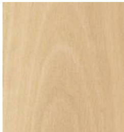
540 Summer Blackbutt