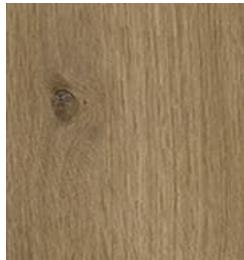
505 Southern Oak