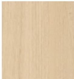
520 Bruny Oak