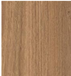
170 Anglesea Oak