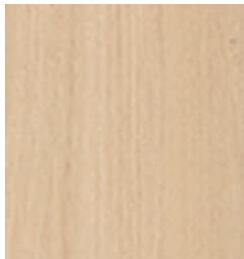
540 Bells Oak