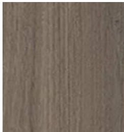
730 Hyams Oak