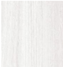
100 Mindil Oak