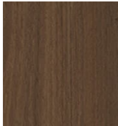
180 Goolwa Oak