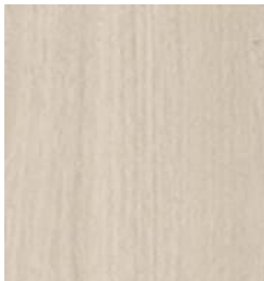
500 Flinders Oak