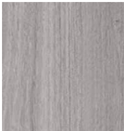
720 Burleigh Oak