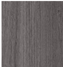
790 Copalis Oak