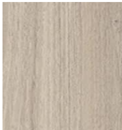
510 Seacliff Oak