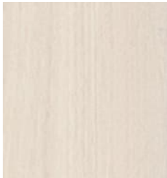
110 Whitehaven Oak