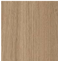
300 Bondi Oak