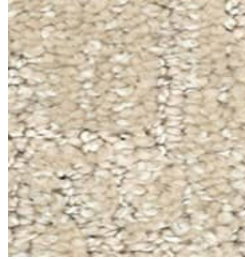
505 Moon Shine