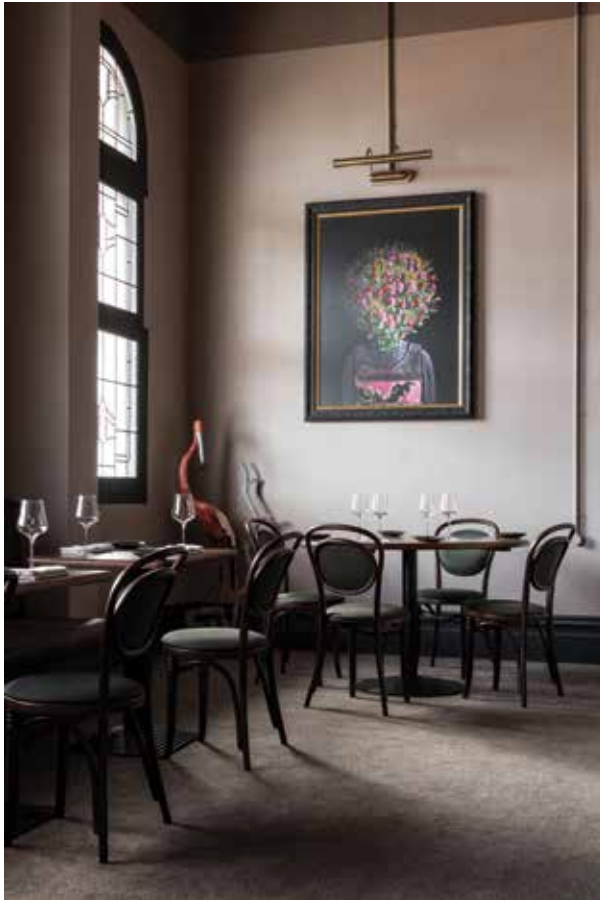
The Royal Hotel