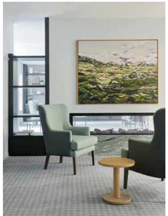
Eva Tilley Memorial Home

The schedule should provide for recording of actual work, done and by whom it is performed, and shall be maintained for reference should any cleaning problems arise. The schedule should be amended as necessary when there is a significant change in the pattern of use of any area.